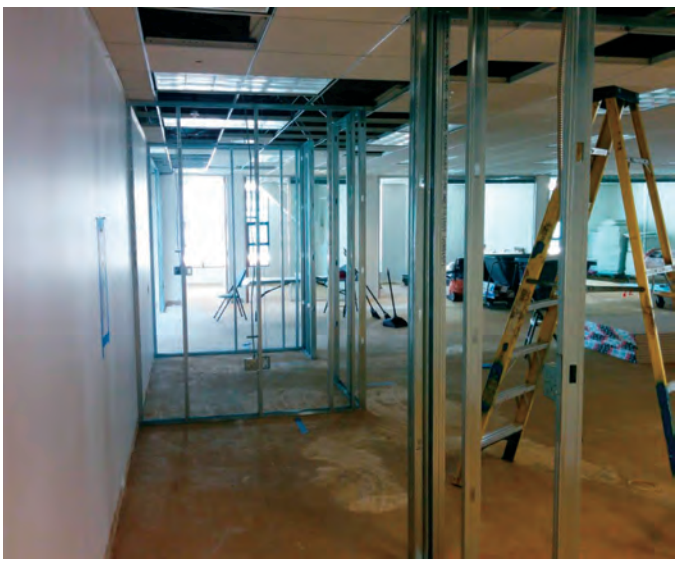
When UCS moved its California office from Berkeley to Oakland, sustainability played a central role in renovation decisions for the new office space. Energy-efficient LED lighting, proximity to public transit, and recycled materials for walls, floors, and counters are just some of the environmentally friendly features of the Oakland office.

Despite these challenges, UCS is committed to investing in energy efficiency whenever possible. In preparing its new California office for occupation, we installed energy-efficient LED lighting where feasible. (We also reduced emissions in other areas by moving to a building directly atop a BART station, thus encouraging staff to take public transit, and by choosing bio-based and/or recycled materials for wallboards, flooring, upholstery, and hard surfaces.) In the one office we own (Cambridge), we completed an audit of our heating system, identifying opportunities for increasing efficiency, and replaced a standard water heater with a higher efficiency hybrid/heat pump unit.