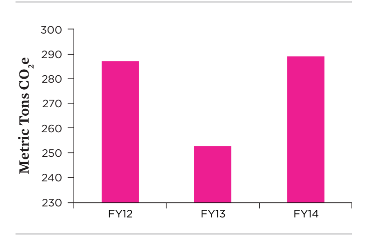
FIGURE 1. Total Carbon Emissions from Business Travel, FY12–FY14

UCS has invested significantly in video conferencing technology in staff offices and conference rooms to reduce the need for, and frequency of, interoffice trips.