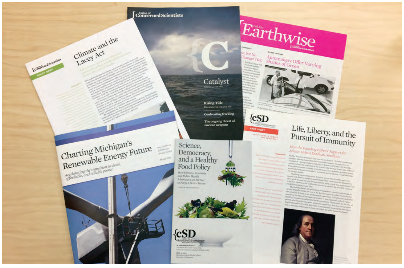
A sampling of the reports UCS produced in FY13 and FY14. These reports have been used by policy makers, the media, and concerned citizens around the country to promote science-based solutions to today's pressing problems.