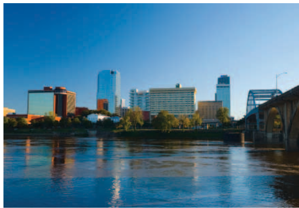
Little Rock, Arkansas. The cost of importing coal is a drain on Arkansas' economy, which relies heavily on coal-fired power. Investments in energy efficiency and homegrown renewable energy can help stimulate the economy by redirecting funds into local economic development—funds that would otherwise leave the state.

Arkansas imported all the coal its power plants burned in 2008—with almost all the supplies coming from Wyoming. To pay for those imports, Arkansas sent $463 million out of state. Entergy Arkansas, the state's largest provider of electricity services, purchased more than 80 percent of that imported coal ($386 million). The utility's White Bluff coal plant, in Redfield, spent $196 million on coal imports—more than any other power plant in Arkansas.