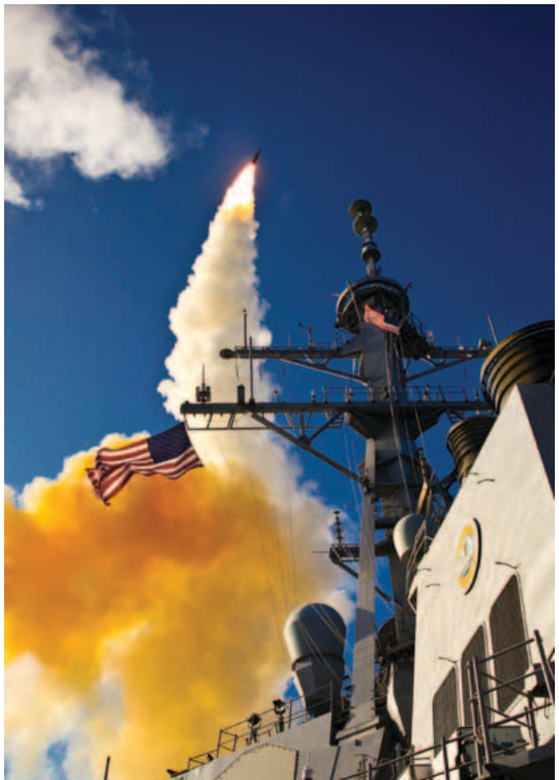
An Aegis SM-3 ballistic missile interceptor is launched from the U.S.S. Hopper. A similar missile was used to destroy a nonresponsive U.S. satellite in 2009.

countermeasures a midcourse missile defense system would face.