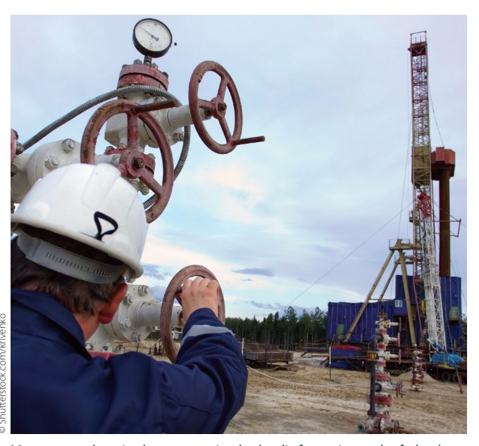
More comprehensive laws governing hydraulic fracturing at the federal, state, and local level can help drive us toward a more transparent and informed discussion on unconventional oil and gas development in the United States.

With respect to air and water quality monitoring, a majority of states with unconventional oil and gas development do not have laws requiring monitoring near drilling sites. The laws that do exist are often weak or limited. Moreover, most operations have not completed environmental impact assessments, so even this basic level of information is not available to the public. Some states have conducted limited monitoring studies around well sites; however, these campaigns are no substitute for the comprehensive monitoring program necessary to detect and