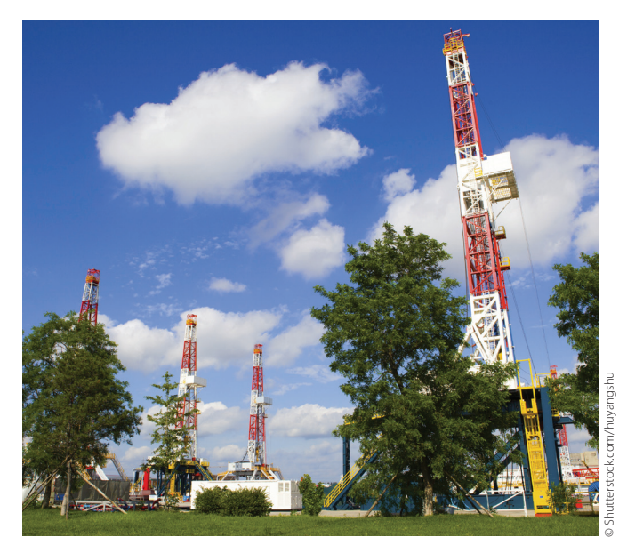
Without strong federal laws in place, regulation of hydraulic fracturing happens largely at the state level. State laws governing the practice vary widely in how much the industry is regulated.

In part to address this regulatory gap, the Bureau of Land Management (BLM) released a revised version of new regulations for hydraulic fracturing on public and tribal lands in May 2013 (BLM 2013a). However, a close look at the BLM rules reveals that they fall significantly short of full, public disclosure in a timely and accessible manner. The rules, which apply to fewer than half of all oil and gas wells, do not make full disclosures available to the public, because a provision allows companies to refrain from disclosing the identities of chemicals that are trade secrets. The disclosed chemicals are posted on the website FracFocus, an online database that has been criticized for storing data in an inaccessible manner (Konschnik et al. 2013). Finally, the rules have no requirement to disclose the chemical contents of the wastewater—both flowback and "produced water"—that comes back out of wells. Thus, the public would have no information about the salinity, radioactivity, or concentration of other hazardous substances present in the wastewater. This provision leaves the public to guess the