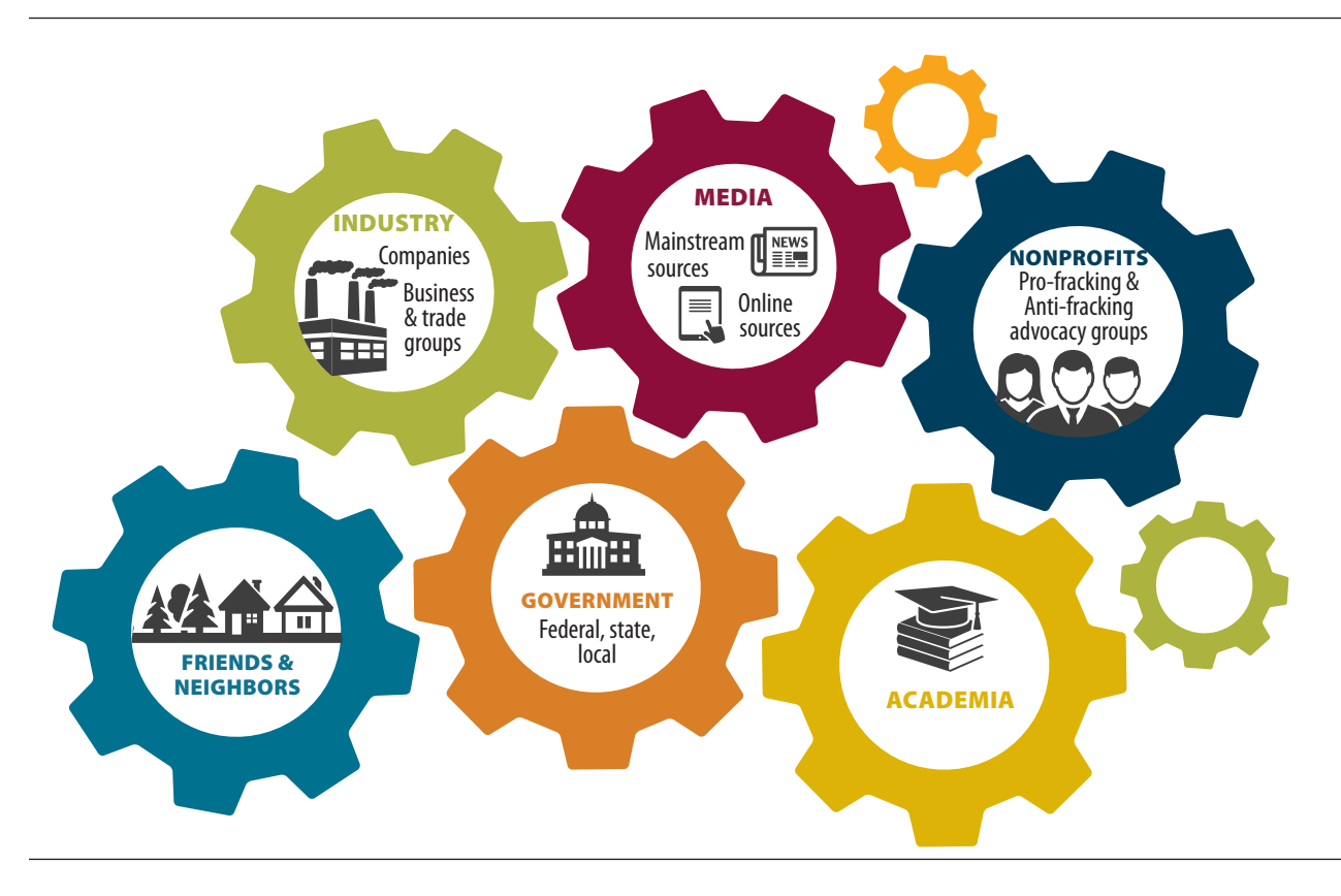
FIGURE 4. CITIZENS' SOURCES OF INFORMATION ON UNCONVENTIONAL OIL AND GAS DEVELOPMENT

Information on all sides of the issue can be "cherry-picked" or skewed. Misinformation is rarely present in the pure form of entirely false statements or fabricated evidence. It comes in varying degrees of seriousness and can include half-truths, misleading phrases or images, distortions of numbers and statistics, omissions of key points, misrepresentations of research, and quotes taken out of context (Brown 2012). Even when no misinformation is present, many factors influence how information reaches and is received by citizens. According to science communication experts, cultural values (Kahan 2013), media and social context (Sheufele 2013), and language choices (Ross 2013) all play a role.