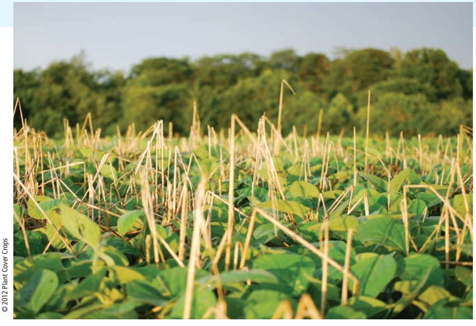
In this field, soybeans are growing up through the stubble of a rye cover crop. Cover crops like this one protect and improve the soil, suppress weeds, and capture excess fertilizer, reducing pollution.

Organic agriculture in particular borrows heavily from the agroecological approach. In place of chemical pesticides and fertilizers, certified organic farmers must rely on healthier soil and more-diverse ecosystems to produce safe, abundant food. These methods have been refined through scientific investigation of the interactions within ecosystems, and sometimes use cuttingedge technologies to achieve results.