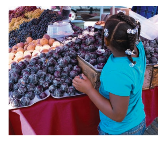
Photo credits (top to bottom)