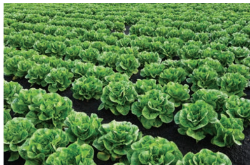
It's time to change federal subsidies that favor processed foods and industrial farming practices.