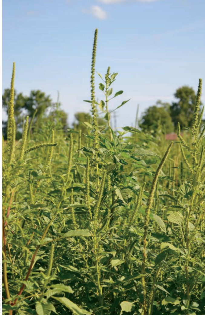
Palmer amaranth, also known as pigweed, infests a soybean field.

Monsanto first introduced its line of "Roundup Ready" seeds in the mid-1990s. These crops—which now include corn,