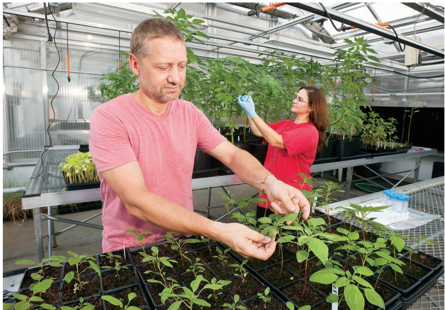
Researchers at Mississippi State University collect samples of wild-type and herbicide-resistant pigweed for DNA analysis. The USDA and public universities should also devote more research funding to ecologically based farming practices and systems that can reduce the development of herbicide resistance.

So it is not surprising that several weed species that include populations of glyphosate-resistant weeds are already showing resistance to at least one other herbicide (International Survey of Herbicide Resistant Weeds 2013), including several of the herbicides slated to be used with the next generation of engineered crops. And if weeds that possess resistance to different herbicides happen to mate, the resulting progeny will be multiple-herbicide-resistant weeds—resistant to all of the herbicides that the parent plants could survive. Regarding waterhemp, for example—a prolific weed of corn and soybean fields in the Corn Belt—there is concern that multipleherbicide resistance may limit farmers' options to lesseffective herbicides (Tranel et al. 2011).