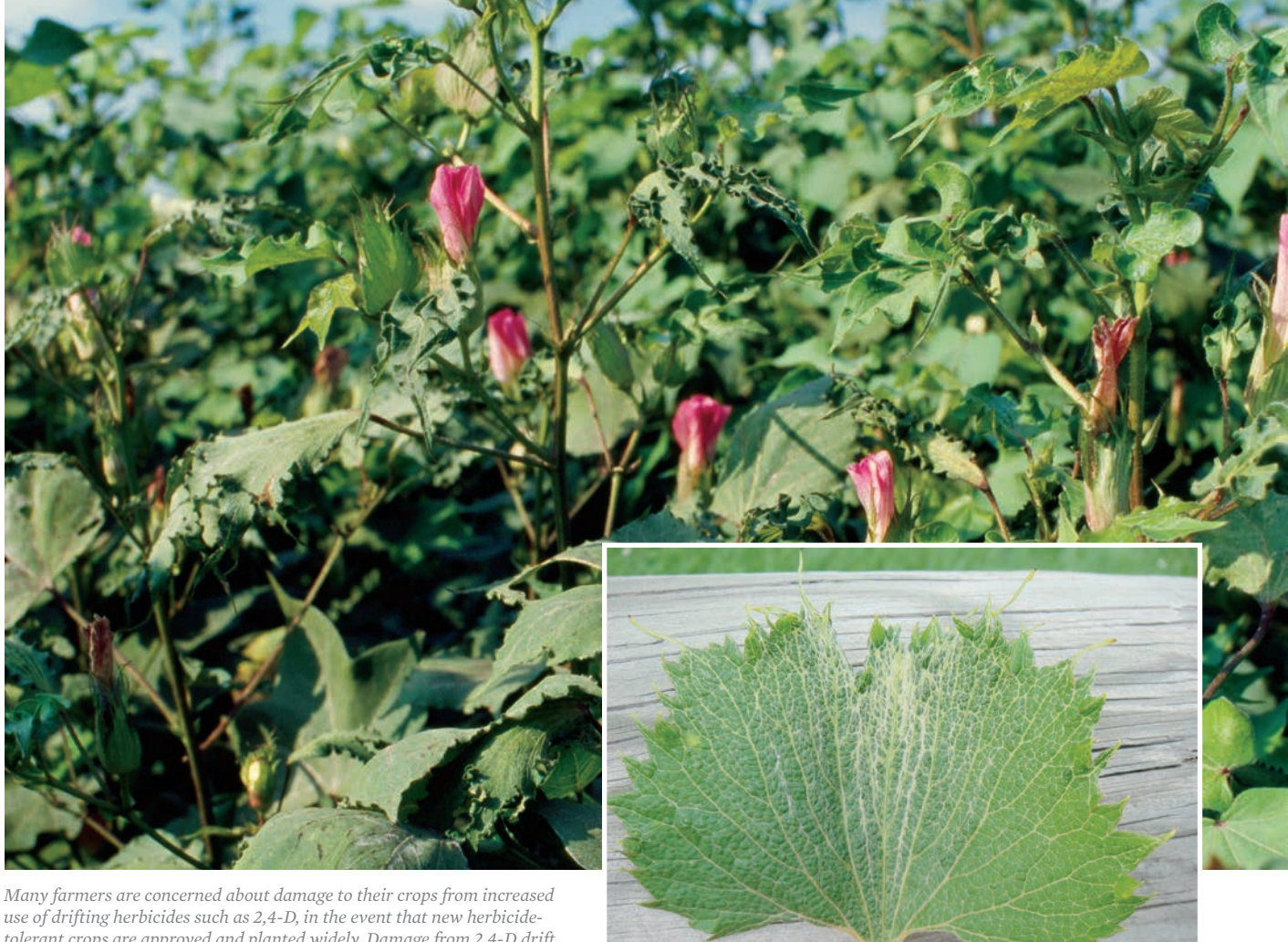
tolerant crops are approved and planted widely. Damage from 2,4-D drift can occur in a variety of common crops, from the cotton pictured here (above) to vegetables and fruits such as grapes (right).

But there are several problems with this argument. Farmers growing new crops that have resistance to glyphosate and one other herbicide-such as 2,4-D-would deploy only that one effective herbicide when glyphosate-resistant weeds were present. Because glyphosate-resistant weeds are now so prevalent, this scenario may often be the case. In such a situation, the weeds would have to develop resistance to only the one additional herbicide to escape control. Moreover, weeds can develop resistance to multiple herbicides through single genes that detoxify multiple types of chemicals (Mortensen et al. 2012; Powles and Yu 2010).