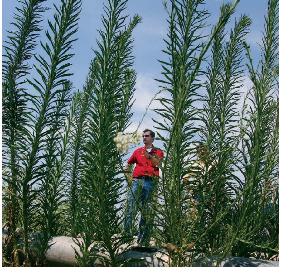
A University of California extension agent stands behind a patch of herbicide-resistant marestail (also known as horseweed) and talks about its effect on farmers. This aggressive weed, which can grow to be six feet tall, has emerged in many parts of the country but is particularly problematic in the Midwest and eastern United States.

Herbicide-resistant weeds are also symptomatic of a bigger problem: an outdated system of farming that relies on planting huge acreages of the same crop year after year. This system, called monoculture, has provided especially good habitat for weeds and pests and accelerated the development of resistance. In