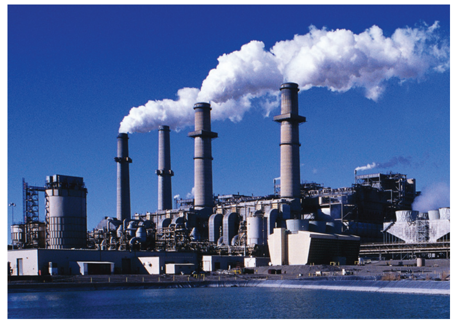
The United States currently generates nearly half of its electricity from coal, the most carbonintensive energy source. Accelerating the use of carbon-free wind power, along with energy efficiency and other renewable energy technologies, will cut emissions from the electricity sector and save consumers and businesses money.

Wind power offers a scalable and affordable way to reduce the electricity sector's global warming emissions. Aside from the relatively minor amount of emissions associated with turbine manufacturing and construction, wind power is carbon-free;