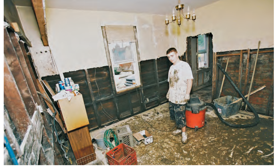
After a 2004 flood inundated this home in Bridgeville, PA, its baseboard and insulation were removed to prevent mold and mildew, which may trigger respiratory illnesses. Floodwaters can pose additional health risks if they become contaminated with chemical pollutants, agricultural runoff, or raw sewage. Even after the water has receded, residents often struggle with stress and other mental health problems.

Every region of the United States has, on average, experienced an increase in the heaviest precipitation events over the past five decades. Future climate change is projected to further increase the occurrence of heavy rain events across North America and heighten the associated risk of flooding. The actual increase in extreme precipitation by