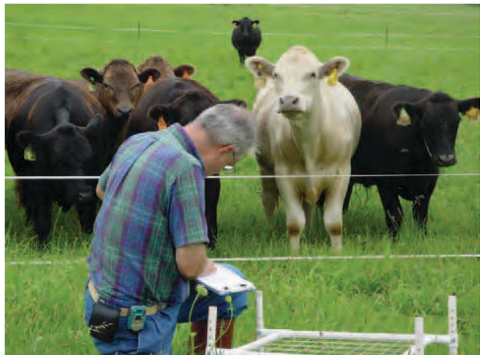
Here, a scientist with the U.S. Department of Agriculture's Appalachian Farming Systems Research Center records the species composition of a pasture. Such records are used by scientists and land managers to develop pasture management strategies that help farmers achieve production goals while meeting the nutritional needs of grazing livestock.

▶ Using the Conservation Stewardship Program to provide incentive payments for: