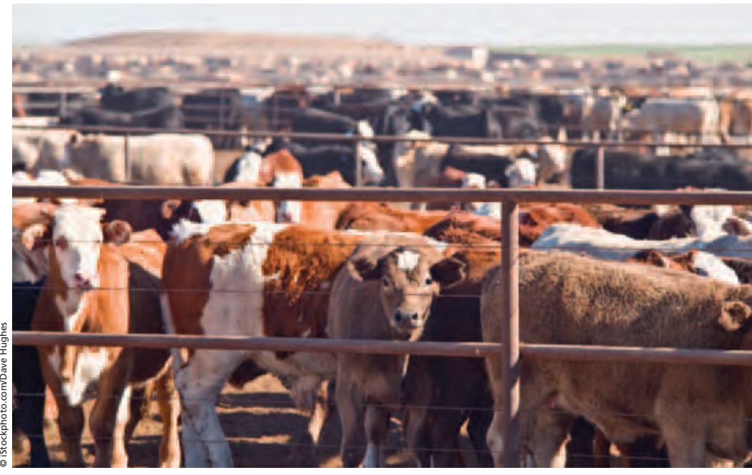
Most U.S. beef cattle today spend several months in CAFOs (confined animal feeding operations), which can fatten cattle more quickly than pasture but are characterized by crowded conditions and the production of unmanageable amounts of waste.

The rate at which cattle gain weight has a large impact on the global warming emissions of beef on a perpound basis, with implications for comparisons of production systems. The high-starch feeds used in CAFOs enable cattle in those systems to gain weight more rapidly and efficiently than cattle that feed on pasture forage, and with fewer calories lost to methane emissions. Across nine studies, for example, the average weight gain of cat-