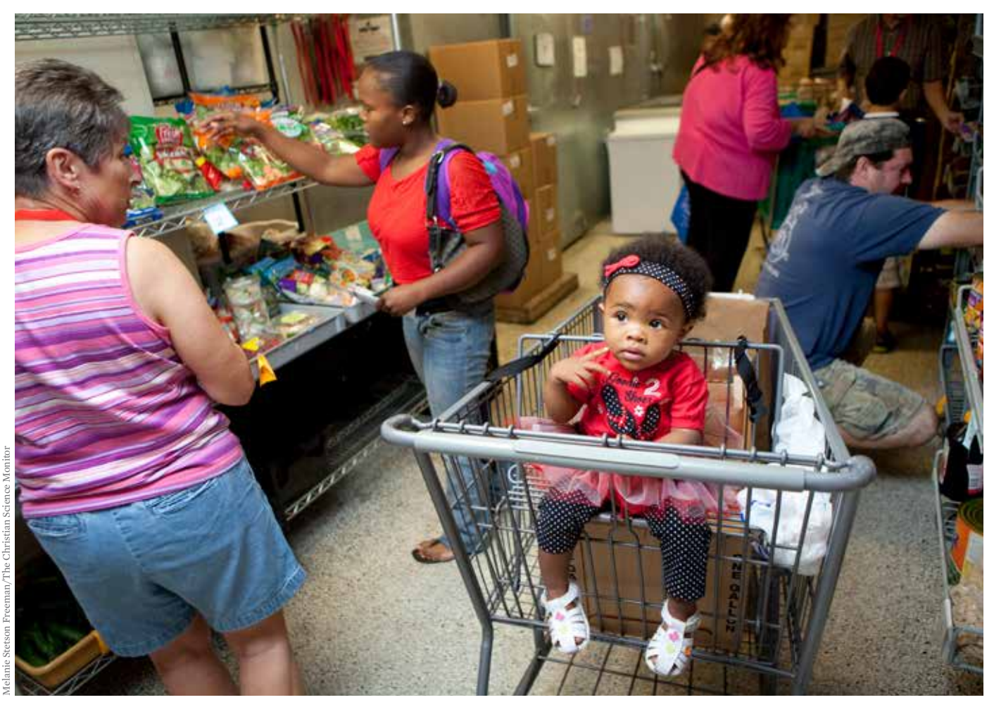
Millions of children and their families rely on federal food programs such as SNAP and WIC. As the Trump administration increases restrictions on eligibility for these programs, more families will have to turn to food banks for assistance or risk going hungry. Food banks are essential resources for communities that are intended to supplement SNAP and WIC, and likely will be unable to meet the need created by federal nutrition program cuts.

Despite the proven benefits to children of federal food programs, the Trump administration has attempted to drastically reduce the number of people enrolled (CBPP 2017). Through the Supplemental Nutrition Assistance Program (SNAP) (formerly known as food stamps) and the Supplemental Food Program for Women, Infants, and Children (WIC), the US government is credited with supporting the nutritional needs of millions of young children and families. Of the 44.2 million Americans receiving SNAP benefits, nearly half are children (44 percent or 19.5 million) (FNS 2019a). While the program is unable to serve all food-insecure children, it does positively affect the lives of those who participate. SNAP participation lifted 3.4 million people out of poverty in 2017, including 1.5 million children. SNAP participation is associated with fewer sick days and doctor visits, lower annual health costs, and reduced risk of low birth weight (Gregory and Deb 2015;