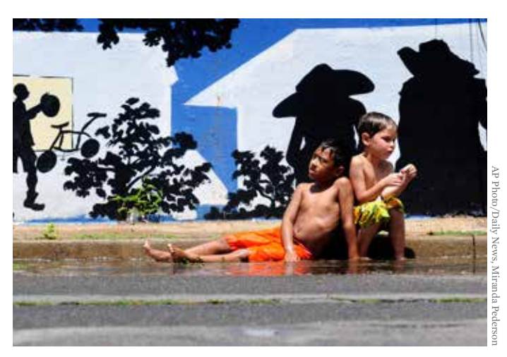
Children are particularly susceptible to the effects of extreme heat because they are less able to read their own bodily cues and know when to rehydrate.

Children face particular risks from air pollution since their lungs are still developing and they frequently play outside.