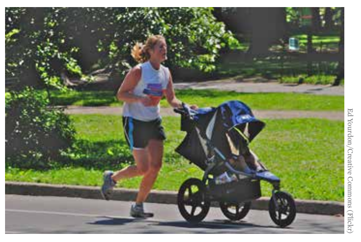
The Trump administration is prioritizing industry over the health and safety of parents and children. Despite more than 200 reports of injuries sustained while using a Britax jogging stroller, the Consumer Product Safety Commission failed to take strong enough action to require the company to notify consumers of the defect and prevent future harm.

Based on experiments and collected evidence, technical experts recommended initiating the recall process. However, Buerkle withheld information on the investigation and the recommended recall from the other four commissioners who, amid significant lobbying from the manufacturing company, initially decided against a recall of the stroller. Instead, the commissioners ordered the company to issue replacement parts and roll out a "robust educational campaign."