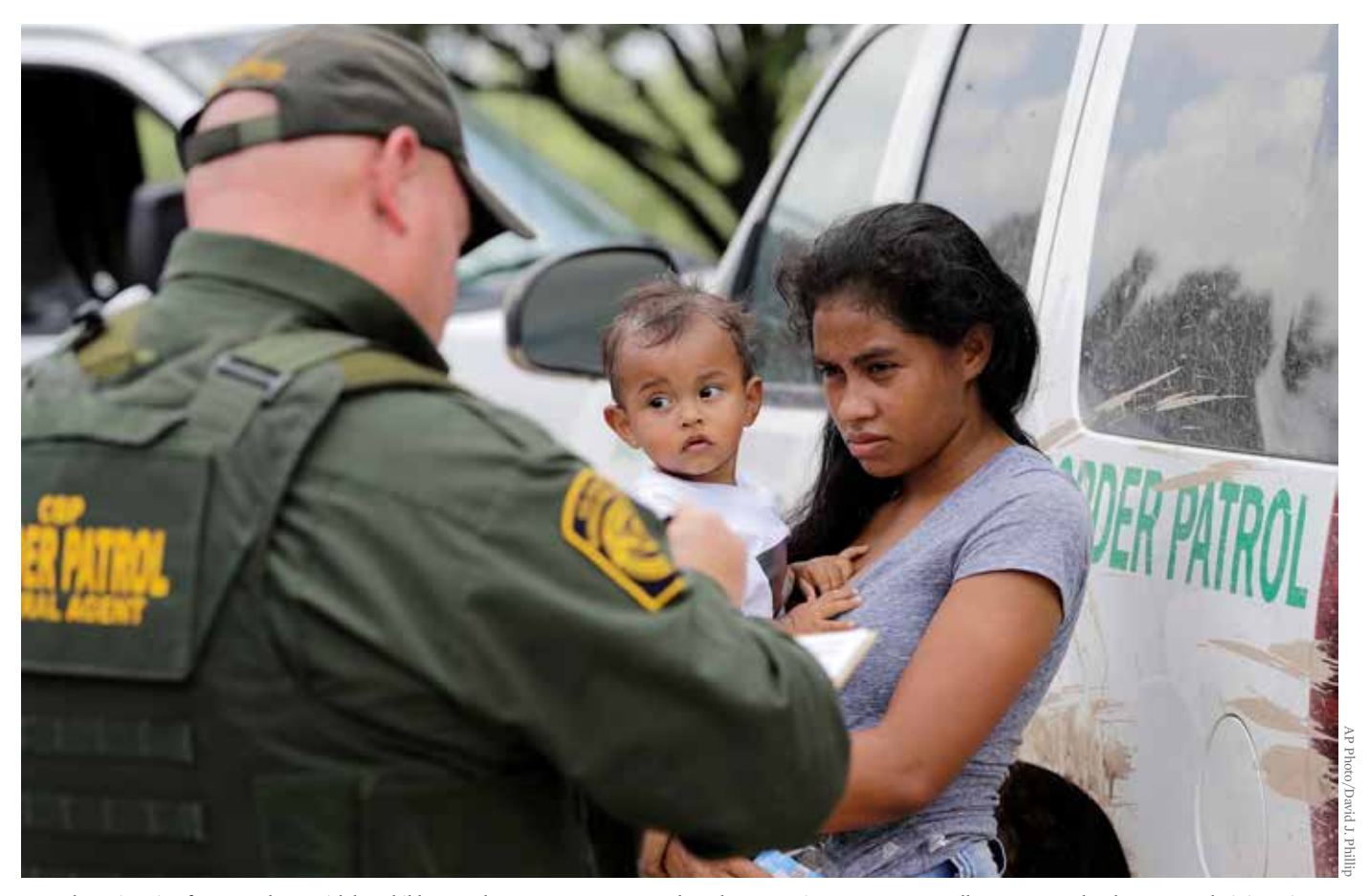
A mother migrating from Honduras with her child surrenders to a US Customs and Border Protection agent near McAllen, Texas. Under the Trump administration's "zero-tolerance" immigration policy, thousands of migrant children are being detained at any given time, with an estimated 5,400 children having been forcibly removed from their parents.