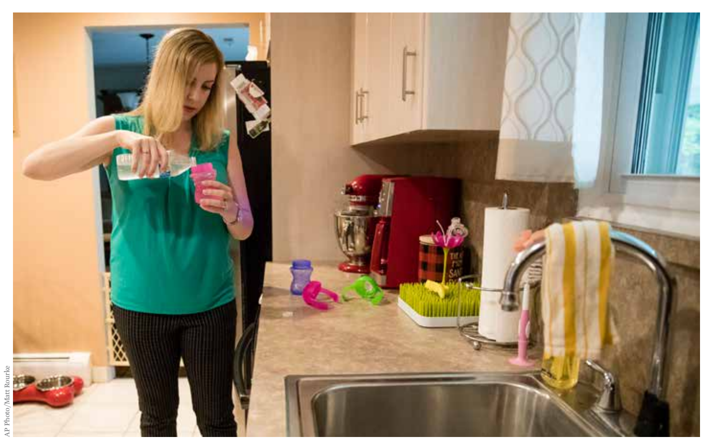
PFAS are a class of human-made chemicals used in manufacturing and in firefighting foam. Use of PFAS can contaminate surrounding water supplies, causing thryoid disease and cancer in humans. The effects of PFAS are especially damaging to the developing bodies of children. Above, a mother provides her child with bottled water in Horsham, Pennsylvania, which has been experiencing PFAS contamination from a nearby naval base.

living near military and industrial sites bear the financial burden of paying for improved filtration of their drinking water and for the medical bills associated with health impacts.