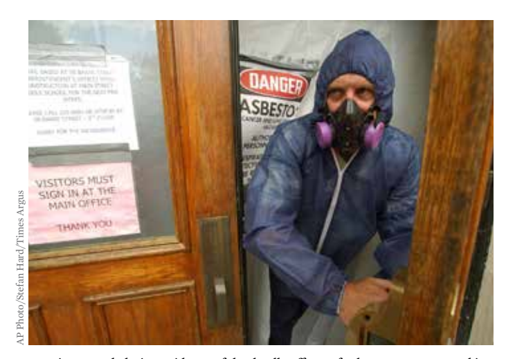
Despite overwhelming evidence of the deadly effects of asbestos exposure and its documented use in school buildings built from 1946 to 1972, the Trump administration is not adequately monitoring or investigating asbestos hazards in schools, including those in disrepair.

Since the 1920s, studies have shown that asbestos exposure is deadly—causing mesothelioma, a rare, aggressive form of lung cancer—yet it was widely used in buildings from the 1950s to the 1970s and in thousands of consumer products (MAAC 2019). As school buildings built from 1946 to 1972 likely contain asbestos, millions of children and adults may still be exposed on an almost daily basis from disintegrating insulation and other sources (Office of Senator Edward J. Markey 2015). And because schools located in marginalized communities are far more likely to be in a state of disrepair, children from low-income communities and communities of color may experience increased exposure to asbestos while at school (Neal 2008). However, the EPA and states are not