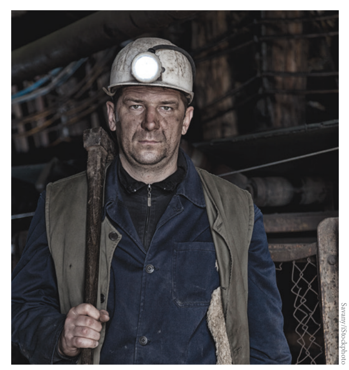
The national shift away from coal as a primary source of electricity has largely left coal miners and coal-fired power plant employees behind. Affordable solutions are available today to honor and support the people who have helped power the United States for generations, and to ensure that affected workers have the time and resources they need to adapt to the new national economy.

This analysis estimates the cost of providing a range of transitional support for coal miners and workers at coal-fired power plants who will likely lose their jobs before they reach age 65 (see Table 1, p. 4, and methodology section, p. 5). It focuses only on direct employment in coal mining and coal-fired power plants, but indirect jobs in the manufacturing and