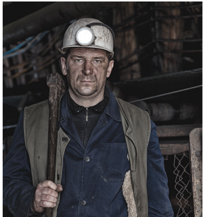
The national shift away from coal as a primary source of electricity has largely left coal miners and coal-fired power plant employees behind. Affordable solutions are available today to honor and support the people who have helped power the United States for generations, and to ensure that affected workers have the time and resources they need to adapt to the new national economy.

This analysis estimates the cost of providing a range of transitional support for coal miners and workers at coal-fired power plants who will likely lose their jobs before they reach age 65 (see Table 1, p. 4, and methodology section, p. 5). It focuses only on direct employment in coal mining and coal-fired power plants, but indirect jobs in the manufacturing and