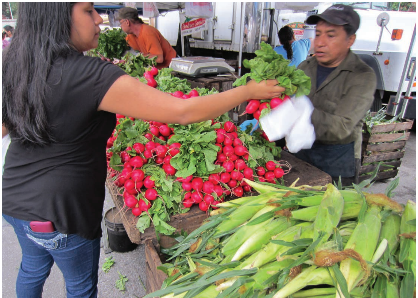
The Harvest Home Farmer's Market in East Harlem, NY, brings fresh produce into a community dealing with high levels of poverty and diet-related diseases.

the federal tax exemptions they receive, hospitals are required to report "community benefit" initiatives they undertake.