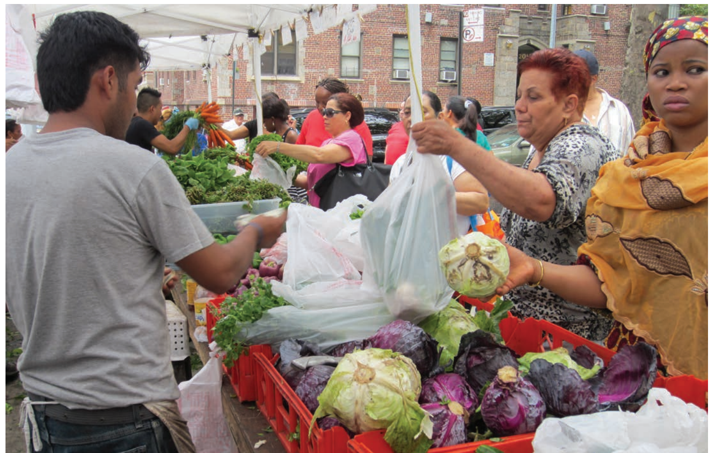
The Mt. Eden Harvest Home Farmer's Market in New York City provides fresh produce to a range of customers including patients of Bronx-Lebanon Hospital Center.

A recent study of select tax-exempt hospitals found that they devoted an average of 8 percent of expenses to community benefits. Actual community benefit expenditures by all nonprofit hospitals nationwide are not reported, but we calculate that they total about $33 billion.