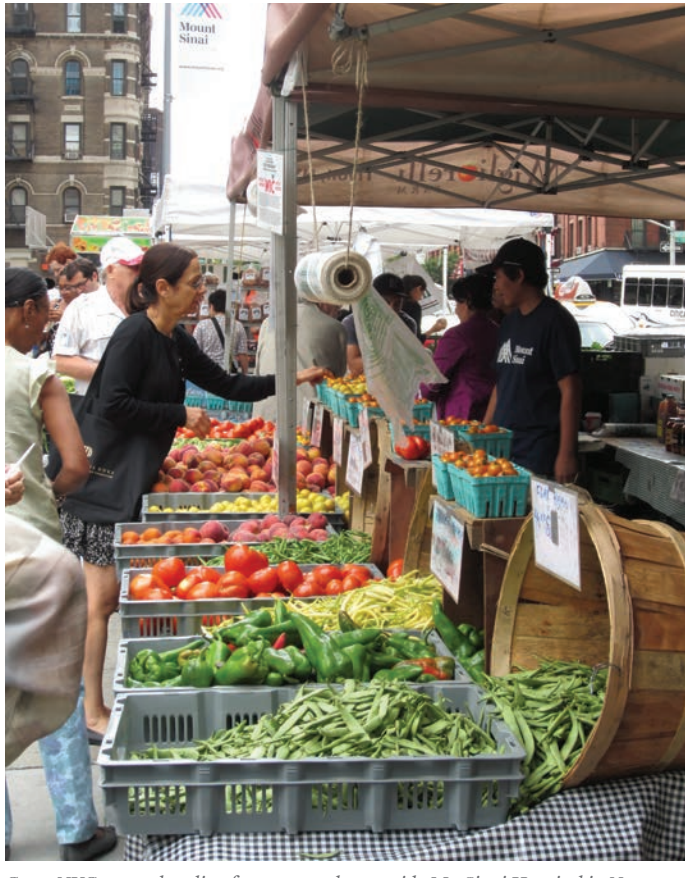
Grow NYC runs a bustling farmers market outside Mt. Sinai Hospital in New York City, offering healthy food to patients and doctors alike. Shoppers receive a two-dollar voucher for every five dollars in food assistance benefits they use. FINI funds will expand programs like these across the country.

The Food Insecurity Nutrition Incentive (FINI) program will provide grants to organizations seeking to increase low-income consumers' purchases of fruits and vegetables at farmers markets and elsewhere.