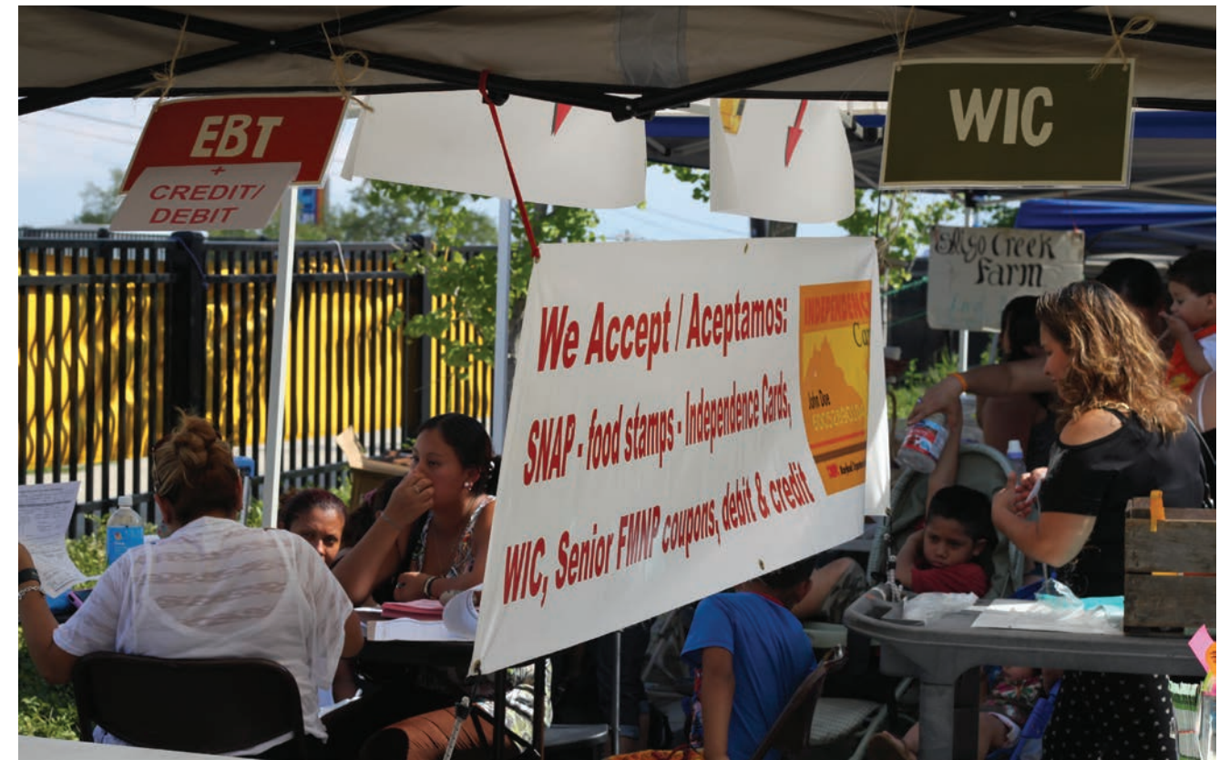
Every growing season, Crossroads Farmers Market in Takoma Park, MD, serves thousands of people who receive food assistance benefits.

The Crossroads Community Food Network and the MDFMA are examples of organizations eligible for funding through the FINI program. And local Maryland hospitals could offer needed help, given that the Centers for Medicare and Medicaid Services are requiring the state's hospitals to achieve $330 million in Medicare savings by 2019. Our review of community benefit reports from Maryland's 46 nonprofit hospitals showed that 80 percent of them offer screening or education programs related to diet or a diet-related chronic disease, but none is significantly involved in food system efforts beyond its own campus.