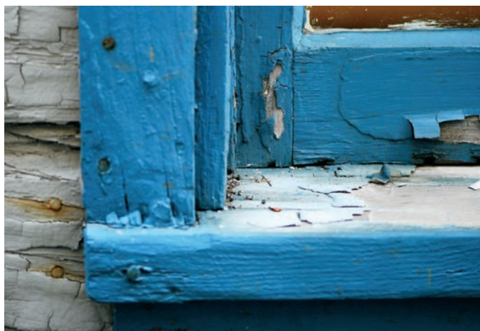
For decades, the lead industry attacked science and scientists to undermine public understanding of the harmful effects of lead on human health, significantly delaying regulation and control of the toxic element.

When BP asked to see their data and methodology, the scientists gave the company 50,000 pages of raw data and information on their research methods. That should have been all BP needed to verify the accuracy of the research. But the company convinced a judge to require the scientists to also turn over their private correspondence. Objecting to that release in the Boston Globe , the scientists noted that “our concern is not simply invasion of privacy, but the erosion of the scientific deliberative process.” They continued: