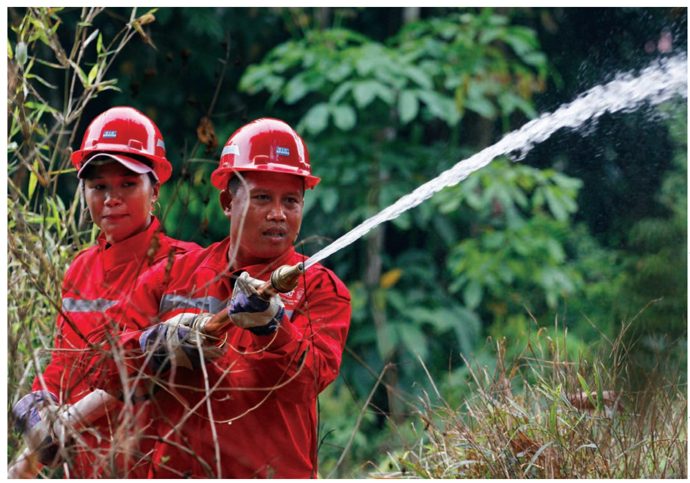
Firefighters, along with outdoor workers and first responders, are at high risk of health complications from landscape fires due to their exertion and proximity to smoke. Pictured are villagers in a fire drill in Palangkaraya, Central Kalimantan, Indonesia.