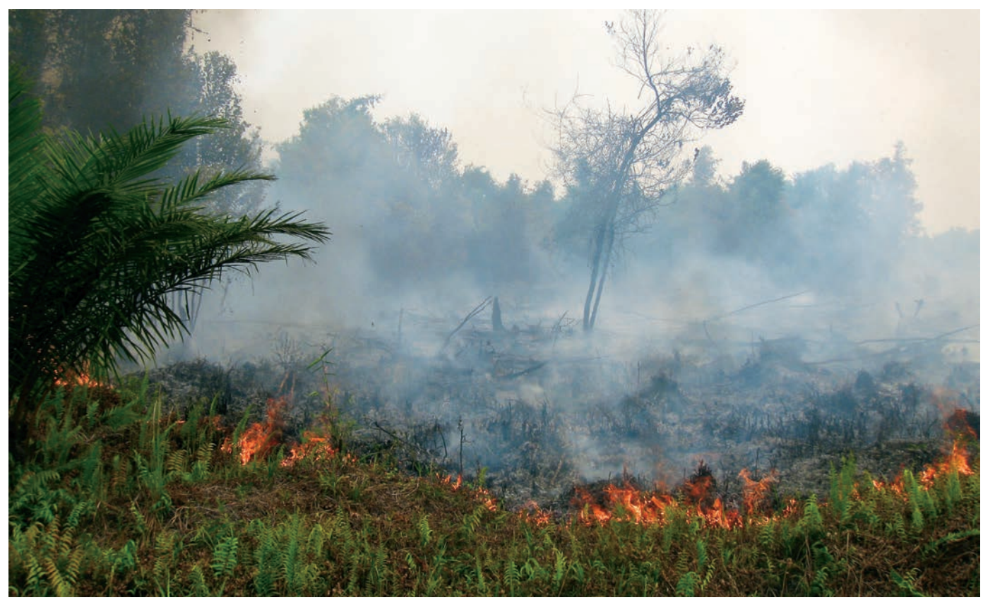
Forest and peat fires in Indonesia, such as this one in Central Kalimantan, Indonesia, can easily become uncontrollable and spread dangerous smoke and haze across the region, significantly impacting human health.

Fire is often used to prepare land for agricultural production, and approximately 20 percent of the fires are known to be located on land designated for oil palm plantations (and the number is likely higher). In the coming years, Southeast Asia's serious problems with frequent, debilitating haze are likely to grow worse. Several current practices will combine with predicted future climatic conditions, most notably decreased rainfall, to make uncontrolled landscape fires more likely. Widespread deforestation leaves land more flammable than intact forests, and the draining of peatlands—normally wet and unburnable soils—leaves them susceptible to fires that can burn for months.