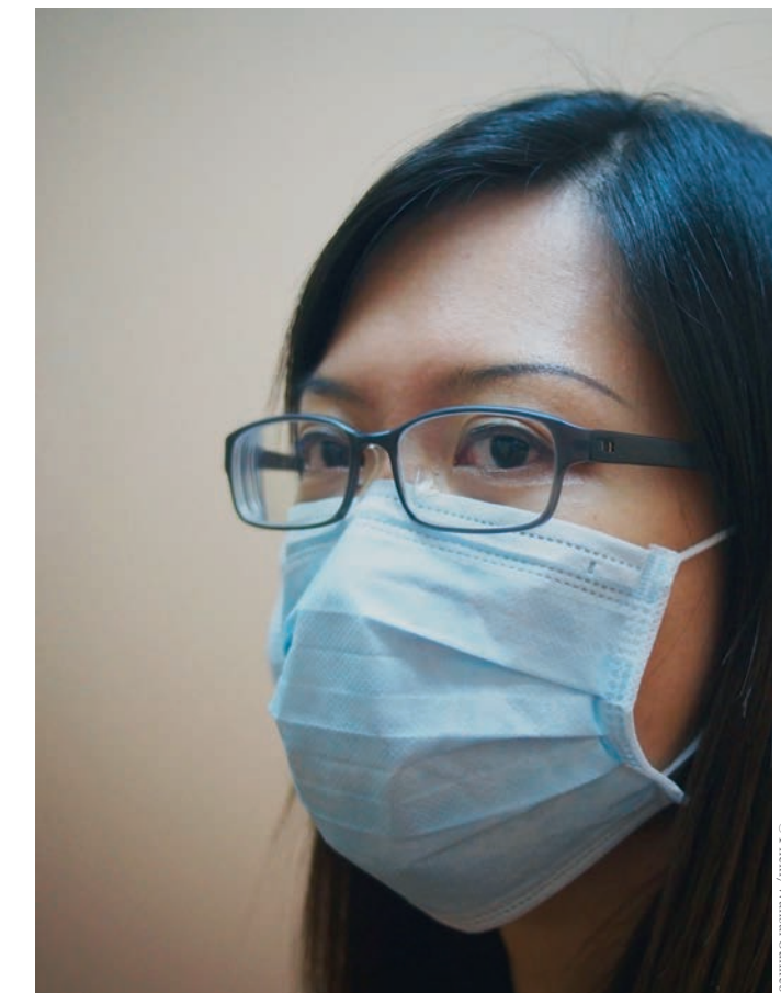
While widely used during haze events, surgical masks, such as this one donned by a woman in Singapore, provide inadequate protection. They do not filter out the small particles that make haze so dangerous.

During haze episodes, many residents of Southeast Asia are exposed to a complex mixture of pollutants, including highly