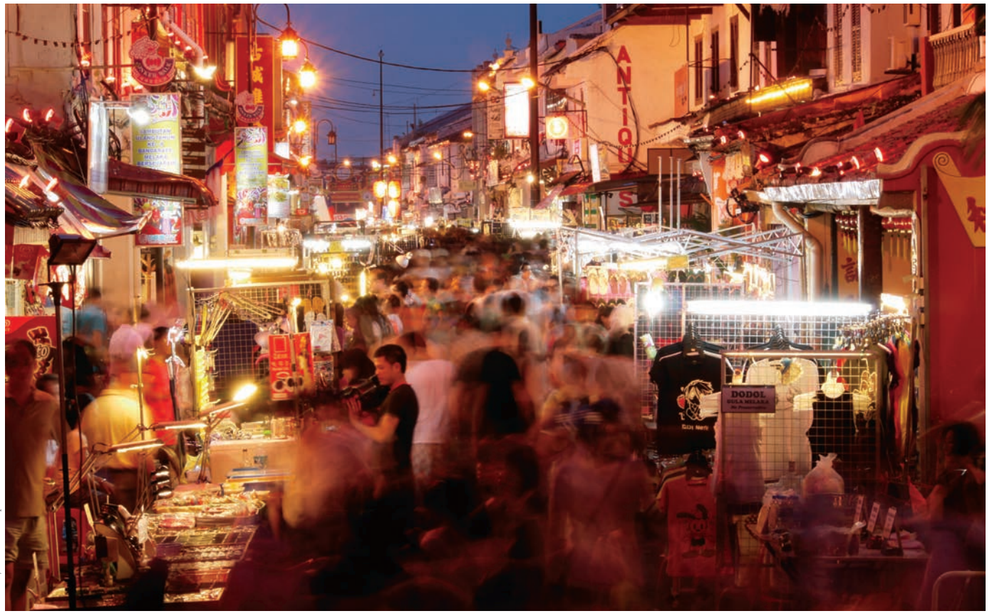
Tourism in Indonesia, Malaysia and Singapore can be severely impacted by haze events, as flights are cancelled, marine transportation is halted, and businesses, like this night market in Malaysia, close.

Pollution Act, an effort to hold entities (such as corporations or even individuals) liable for any involvement in landscape fires polluting Singapore's air (Parliament of Singapore 2014). The law is especially notable in that it proposes to hold these entities responsible for haze even if the haze originates in areas outside of Singapore. A corporation could be charged with a criminal offense and fined for burning areas, even those in other countries, if that burning affects air quality in Singapore. In addition, the law allows any person or business who sustains physical injury, damage to personal property, or other economic loss from haze to bring suit against responsible parties. The international implications of this law may make its implementation difficult, but its strong penalties for bad actors could go far toward holding parties responsible for adverse health and/or economic impacts.