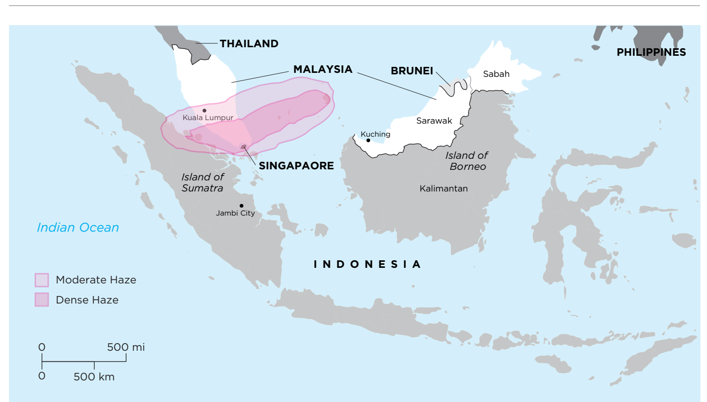
FIGURE 1. Spread of Haze in South Asia on June 21, 2013

Palm oil is a major contributor to the economies in these Southeast Asian nations and is therefore looked upon favorably by some governments. In Indonesia, the oil palm plantation sector is responsible for around 3 million jobs (BAPPENAS 2009). In Malaysia, the minister of land development for the state of Sarawak, on the island of Borneo, stated a goal to