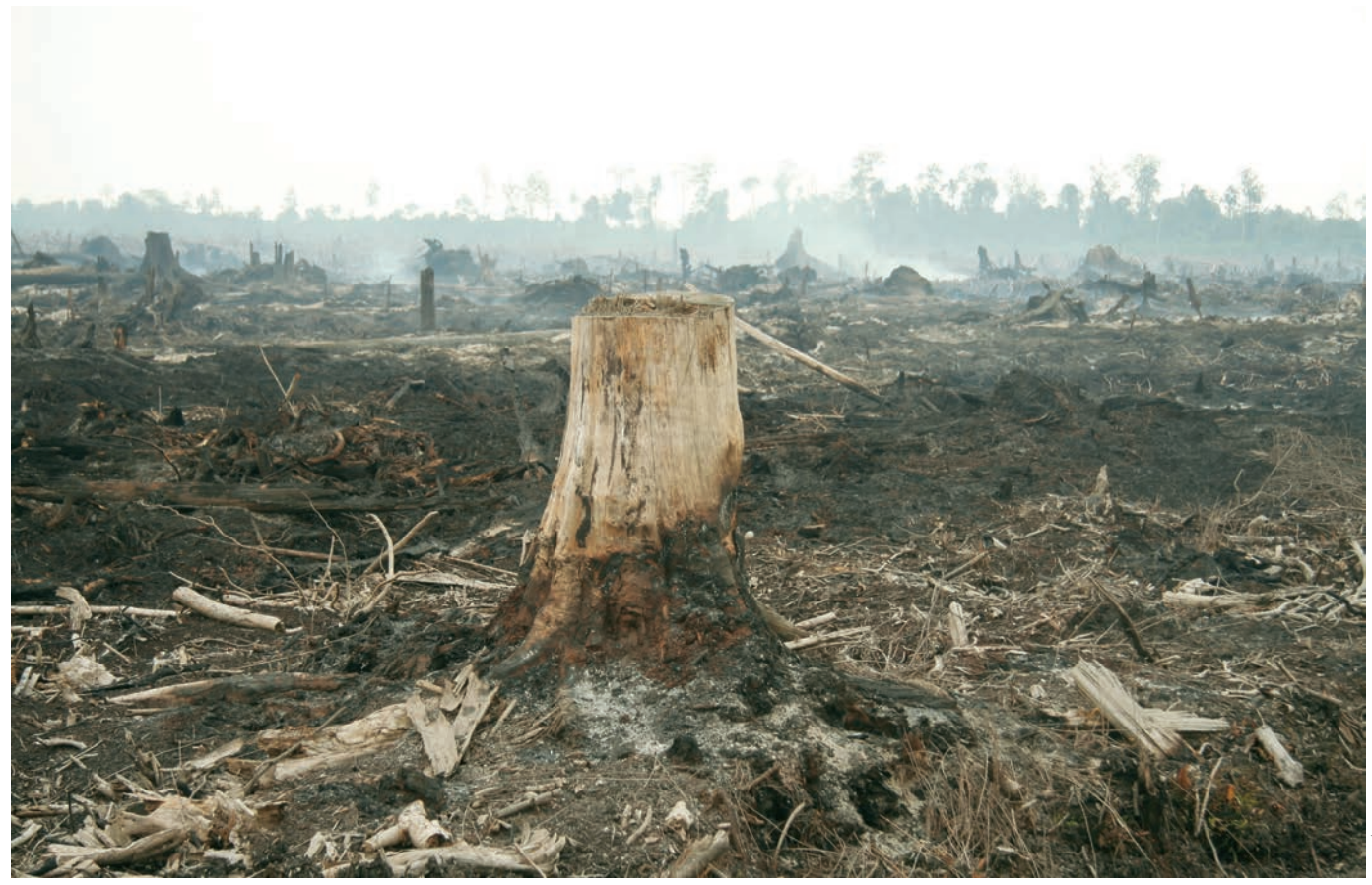
Fires on peat can be very difficult to extinguish, burning slowly for months or even years due to the depth and organic density of peat soils.

fragments, and the peat soil itself. The surface fires can progress to deep fires that generally burn at a depth of 8 to 20 inches (20–50 centimeters) and can burn yet more deeply. Sub-surface peat fires can also travel horizontally, sometimes leaving the surface unburned. Once deep peat begins to burn, the fires become very difficult to extinguish. Even heavy rainfall may not extinguish the fires completely, and they can continue to smolder for months or even years (Usup et al. 2004).