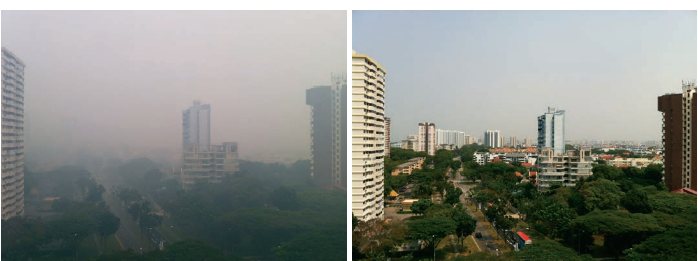
These photos, looking toward Marine Parade Road in Singapore, compare the haze conditions on June 21, 2013, to the clear conditions on June 24, 2013. The June 2013 haze event was particularly acute, severely limiting visibility in the region.