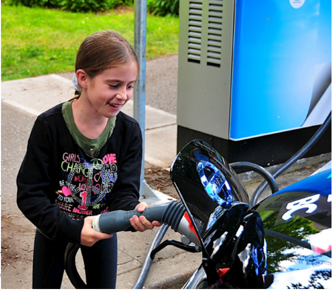
Mile for mile, driving an EV in Oregon is both cleaner and cheaper than driving a comparable gasoline-powered vehicle. And as the state brings more renewable energy to its electric grid, the environmental benefits of EVs will increase.

requires a stable policy environment that promotes demand for clean fuels over a multivear timeframe. Oregon's Clean Fuels Program will provide that assurance to investors-so long as it remains intact.