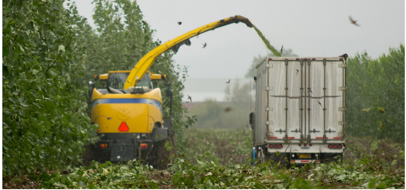
Hybrid poplar is a promising source of sustainable biomass in Oregon. It is one of the fastest-growing tree species and well-suited to the state's climate.

when trees are harvested for lumber. Some of these materials could be collected productively to make biofuels, helping to reduce the risk of wildfire without affecting the sustainability of the forest. The Oregon Department of Environmental Quality estimates that the state's forest and agricultural residues could produce 182 million to 282 million gallons of gasoline-equivalent biofuels per year by 2025. (ODEQ 2011).