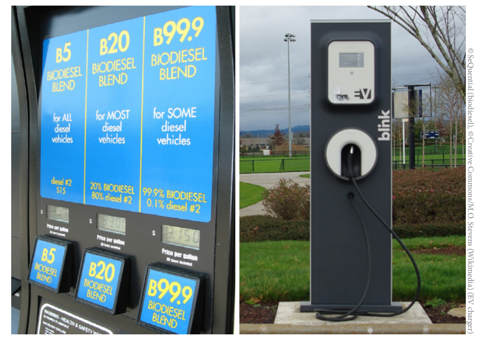
Biofuels and electricity are already helping to reduce Oregon's contribution to global warming. Strong policies such as the Clean Fuels Program are critical to ensuring the state's low-carbon fuel market can continue to grow.

Oregon already generates half of its electricity from hydropower and renewable resources like wind (ODE 2015), and it produces biodiesel from used cooking oil. It can steadily reduce oil use and carbon pollution even further by scaling up the share of transportation powered by clean electricity and increasing diverse biofuels. To do so, it can draw on diverse sources of waste-based fuels such as biomethane from landfills and water treatment plants, while further driving innovation in the next generation of biofuels made from wood waste, hybrid poplar, and garbage. These fuels can also support research and innovation in industries that keep transportation dollars in the local economy while creating jobs.