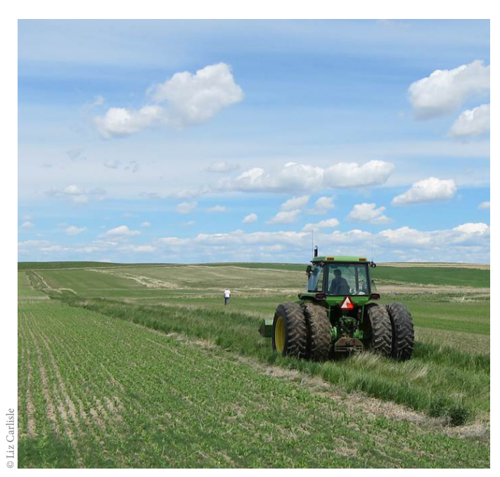
More than 20 different crops rotate through fields at Vilicus Farms in Montana, while pollinator-friendly border plantings between each crop plot help promote biodiversity. More federal funding and policy support are needed to refine these and other agroecological practices and help farmers adapt them to different regions, climates, and farming challenges.