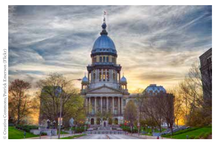
With well-designed policies and careful planning and coordination, Illinois can greatly increase its clean energy resources, cost-effectively comply with the emissions reductions required by the Clean Power Plan, and reap important economic and public health benefits in the process.

Illinois electricity providers should work to diversify their electricity portfolios, prioritizing low-cost renewables and efficiency. These steps will help cut consumer electricity bills and further curb harmful emissions from power plants.