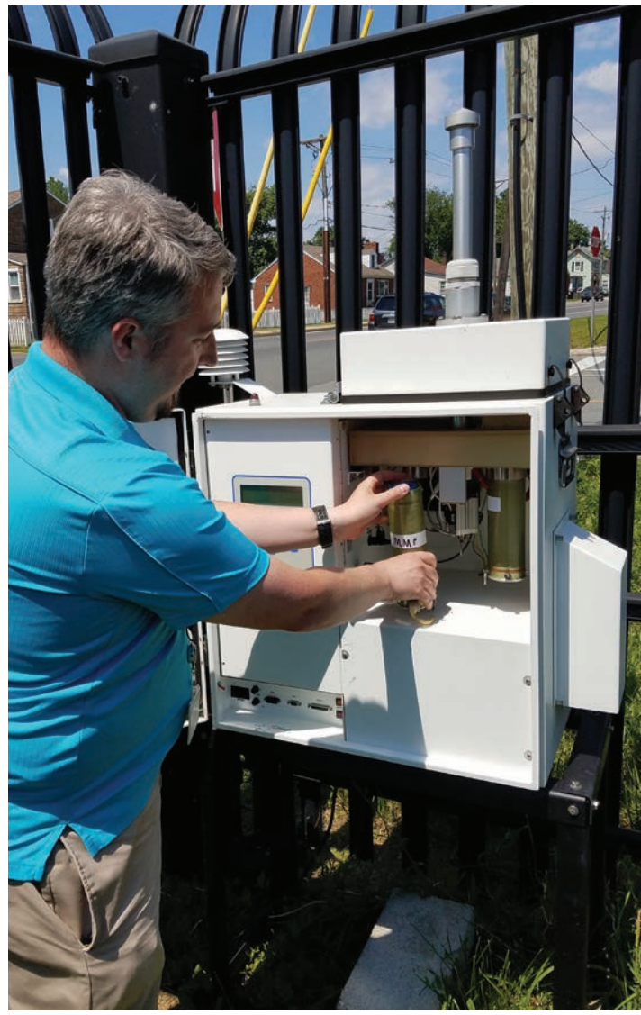
Regular monitoring of air quality near pollution sources is crucial to understanding community exposure to harmful pollutants.

be identified before they lead to disasters. Locally, cities and counties must do a better job of enforcement in areas of "jurisdictional overlap." There must be an accountability mechanism in place for communities to enforce existing ordinances, especially those with a goal of protecting public health.