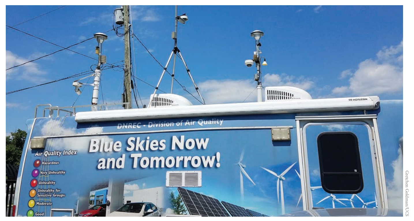
Mobile air monitoring stations like this one from the Delaware Department of Natural Resources and Environmental Control can allow communities to obtain air pollution data from locations without permanent monitoring but where pollutant levels may be high.

requirements for oil refineries to monitor benzene at their fenceline by including other toxic air pollutants such as toluene and xylene, and should require fenceline monitoring at other major industrial sources.