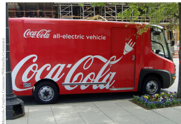
Electric delivery trucks, such as this Coca-Cola delivery truck in Washington, DC, not only have lower greenhouse gas emissions compared with conventional trucks, they also generate no tailpipe pollution—a major benefit to the communities in which these trucks operate.

In developing these recommendations, UCS found that electric utilities are well positioned to advance the deployment of electric trucks and buses and support “smart charging” practices through several types of programs. These include direct investments in the charging infrastructure, rebate incentives that encourage the hosts of charging sites to install infrastructure, and fair rate structures that remove undue barriers to electrification.