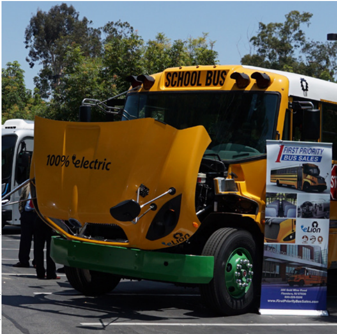
When not in use, electric school buses have the potential to store electricity when renewable energy is at its peak, and then discharge it back to the grid when demand is high.

school bus pilot programs can provide empirical evidence on the effects of charging and discharging cycles on the degradation of battery capacity. Further, electric school buses reduce the exposure of children to pollution, thus serving a demographic particularly vulnerable to suffering health impacts from air pollution. Finally, electric school bus programs can familiarize children, parents, and school employees with EV technology in general. PG&E and Consolidated Edison are among the utilities studying the potential for grid services from electric school buses through pilot programs. As more electric models become available, utilities should consider opportunities to advance electrification and assess the potential grid benefits of additional vehicle applications, such as regional and long-haul trucking.