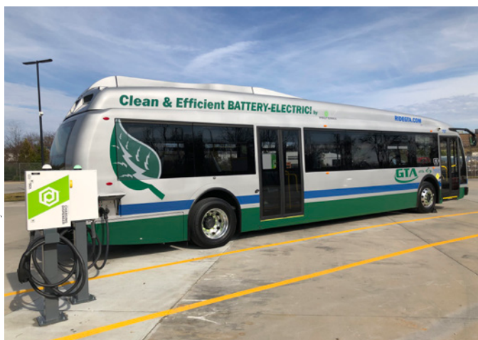
Greensboro, NC, is just one of many US cities committed to increasing the number of electric buses in its fleet. By partnering with fleet operators, utilities can help bring more electric trucks and buses onto our roads.

To manage charging most efficiently and effectively, truck and bus managers need chargers that communicate with network management systems. Beyond the immediate benefits, capabilities for smart charging and networking are forms of “future-proofing.” They allow for later upgrades to provide more sophisticated grid services, such as vehicle-to-grid power supply, as those capabilities become available for some vehicle applications. For these reasons, utilities should include minimum capabilities for the charging system that enable managed charging as a requirement of truck and bus charging programs.