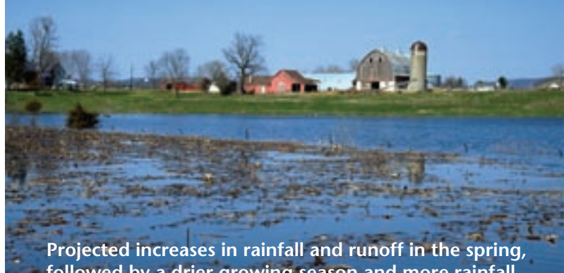
Projected increases in rainfall and runoff in the spring, followed by a drier growing season and more rainfall during harvest times, will be challenging for Great Lakes farmers.